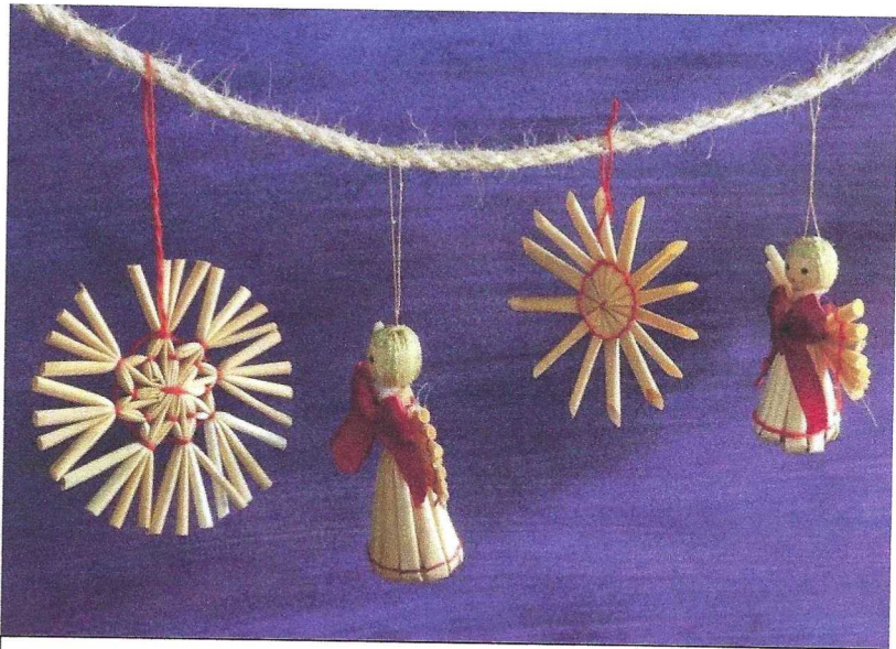
(above) A string of star and angels made from straw. (left) An individual straw angel.