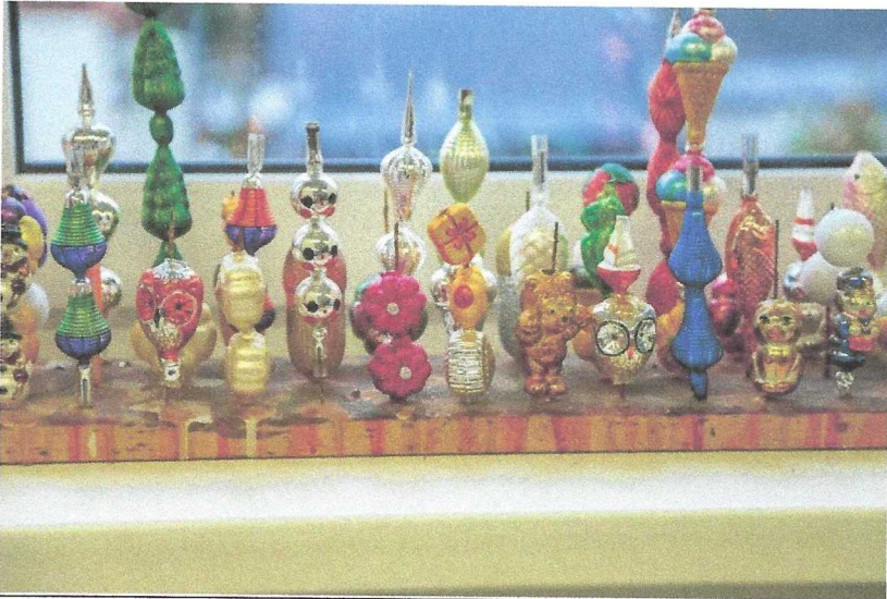
Christmas ornaments made in Pomiklá, Czech Republic

Do you have any glass Christmas ornaments passed down through your family or have purchased beaded ornaments from folk fairs? There is a good chance that they have a Czech origin near Krkonoše in the village of Poniklá in North Bohemia. This village was added to UNESCO's (United Nations Educational, scientific, and cultural organization) cultural heritage list in December 2020.