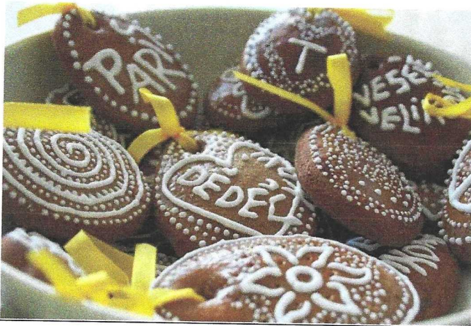
Cookies prepared for decorating the Christmas tree

Bohemia known for its jewelry creations also produce glass Christmas ornaments. One of the largest manufacturers of hand painted glass Christmas